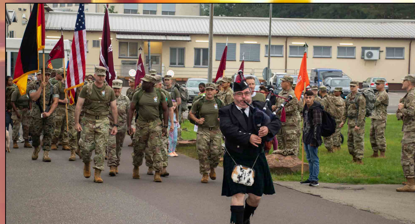
Landstuhl Regional Medical Center Service Members, staff and families participate in a ruck march around the LRMC campus as part of the 9/11 Observance, marking the 20th anniversary of the events, Sept. 11. The observance, organized by members of the U.S.O., Wounded Warrior Project and LRMC's Medical Transient Detachment, also included a candle lighting ceremony memorializing the lives lost on 9/11 and subsequently as a result of U.S. involvement throughout the War on Terrorism.