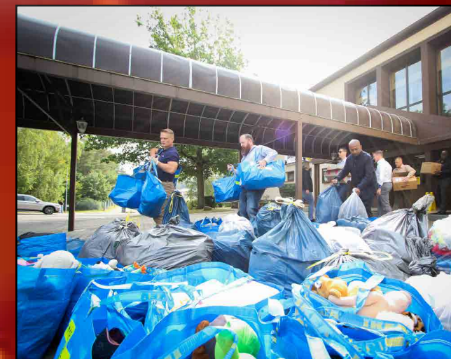
Bags of donated clothes, toys and other items are placed outside the Armstrong Club on Vogelweh for pick up in support of donation efforts to Afghan evacuees as part of Operation Allies Welcome, Sept. 16. The donation efforts were part of a team-building exercise during the Commander's Strategic Offsite event which aimed to increase teamwork, and communicate the LRMC mission and vision to leaders of the organization.